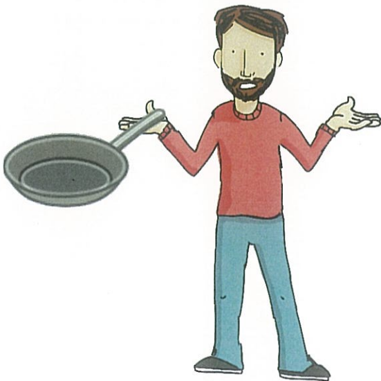
Picture of a man holding a pan