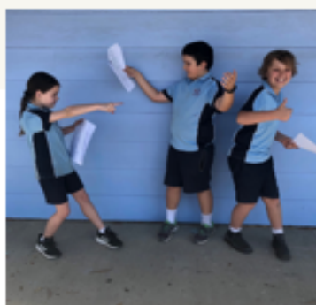
THE CAST OF 'A WOLF'S TALE'

You will be entertained by students from Woy Woy Public School.